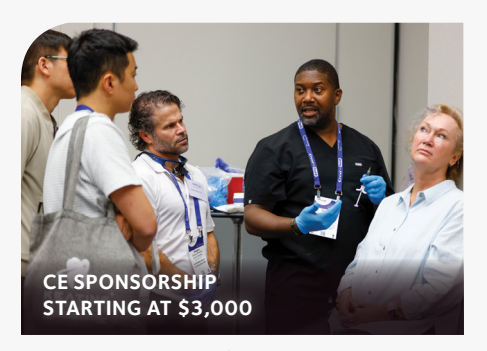
Show your support for dentists and their teams by sponsoring CE—Presentations, Experiences & Conversations, and Hands-On Activities.