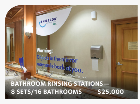
Sponsor mirror clings and your product for all to sample.