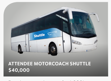
Exterior messaging seen by 1,000's