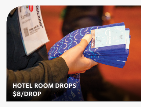
Get your message directly into the hands of attendees of select block hotels.