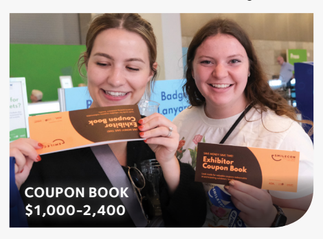
Drive attendees to your booth with special offers or giveaways.