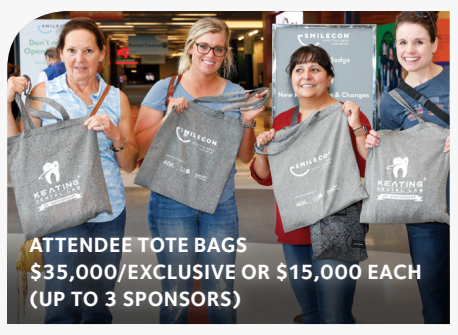
YOUR name on every attendee tote bag. Includes a promotional insert provided by sponsor.