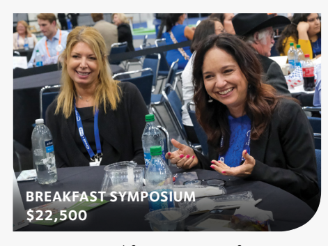
Sponsor a Breakfast Symposium for up to 150 attendees featuring one or more Key Opinion Leaders. *Food and beverage not included