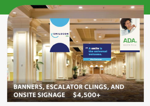
Check out Envision to see available opportunities.

Customize your package or choose from our à la carte items. SmileCon has a wealth of options!