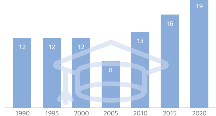
GRADUATES OF OMP PROGRAMS started at 12 in 1990 before decreasing to 8 in 2005. Since then, graduates increased to 19 by 2020.