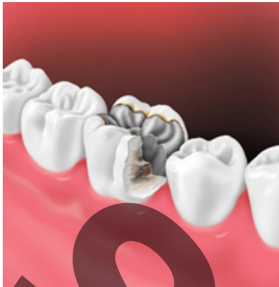
Before crown: Worn filling with decay and broken cusp