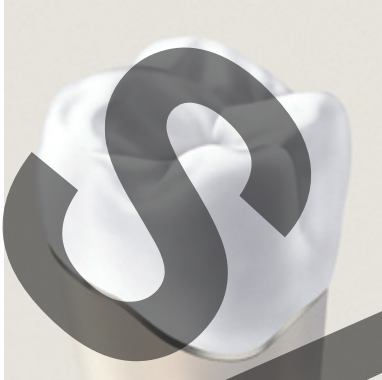
Full porcelain fused to metal crown

Crowns are made from several types of materials. Metal alloys, ceramics, porcelain, composite resin, or combinations of these materials may be used. In the process of making a crown, the material often is colored to blend in with your natural teeth.