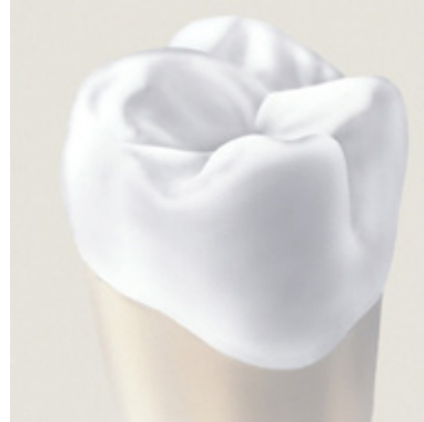
Full ceramic crown

Your dentist wants to create a crown that looks natural and fits comfortably in your mouth. To decide on the material for your crown, your dentist will consider the tooth location, the position of the gum tissue, the patient's preference, the amount of tooth that shows when you smile, the color or shade of the tooth, and the function of the tooth.