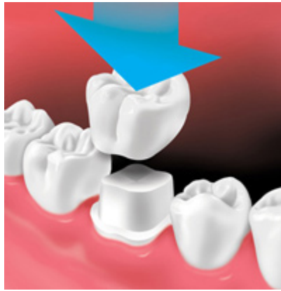
Crown positioned over prepared tooth