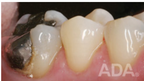
Before- Filling with decay at the edge