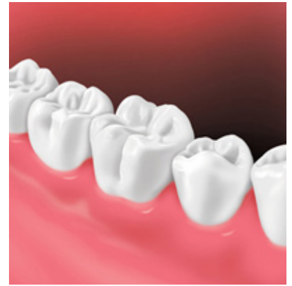
After crown placement